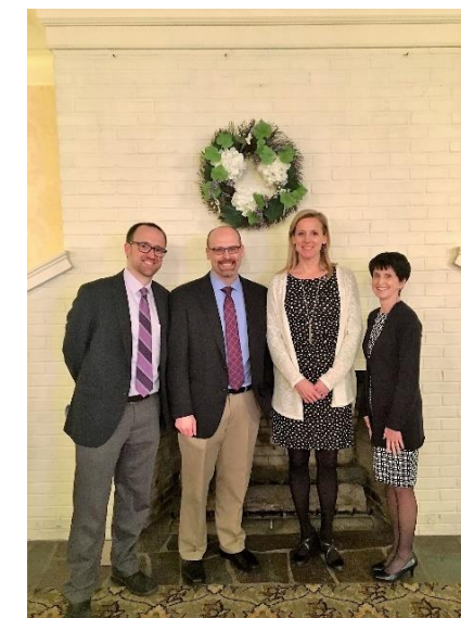
Course Faculty and Introductory Speakers

The Torrington Area Health District (TAHD) utilized the opportunity to conduct a brief survey regarding the experience of prescribers using the CT Prescription Monitoring and Reporting System. They are one of five local health departments that received a “ Change the Script ” grant from the State. The SCOPE of Pain training event presented a very successful collaborative opportunity for CT-ORH and TAHD.