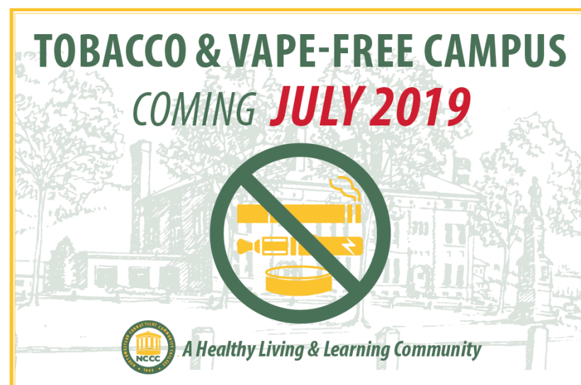
Tobacco-Free Messaging and Signage at NCCC

This initiative will continue in the 2018-2019 fiscal year.