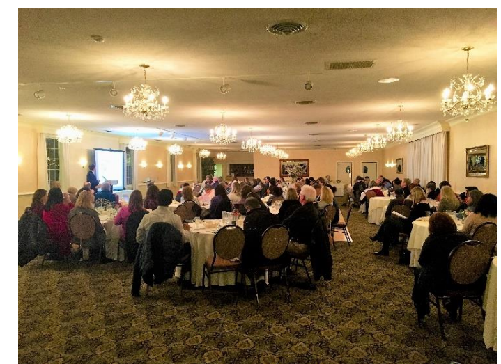
Opioid Prescribing Training in Torrington, CT